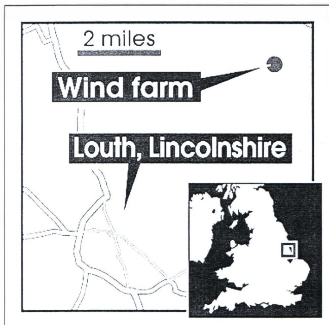
Impact ... map showing UFO sighting

Afterwards there was no trace of one of the turbine's three huge 65ft blades — ripped off in the collision.